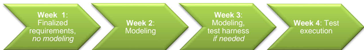
Figure 4: Agile sprint schedule using MBT

The developers spent the first week of each sprint deciding what new functionality to include, and fixing previously found defects. The second week was spent developing code, during which time the modelers extended the existing model and generated new test cases for automated execution of the code with the new enhancements. The test execution harness and its function library were updated as required during this sprint, so it was ready for immediate automated test execution at each incremental code drop. The company also extended MBT testing through Conformiq to include connecting with, and verifying, the correctness of the data in the database within this application.