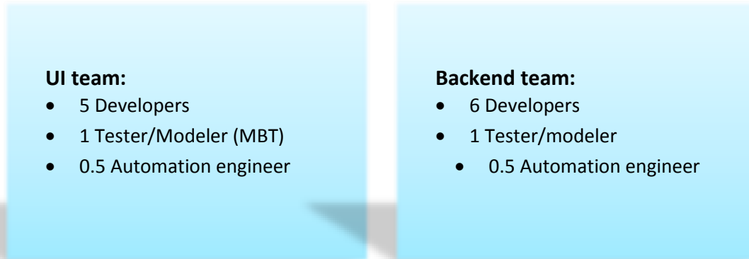
Figure 3: UI and Back-end Teams

Following the Conformiq 360° Test Automation methodology, a model was created for each of the two components: the UI and the backend business rules operation. This modeling included an abstract in-model database to mirror the database of the real system. Reusable components were created at the model level for use across both groups. The modelers were an integral part of the development teams and attended all the development meetings.